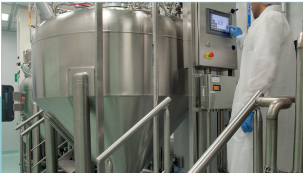
LDO is a global specialist for producing Heparin sodium, Heparin calcium and Heparinoids

The Minebea Intec load cells and weighing electronics in Hygienic Design provided a weighing solution that was conducive to LDO's needs: it obtained the Italian AIFA approval in 2016 and has now also achieved FDA compliance for API production, allowing it to open up to the large new market that is the US market.