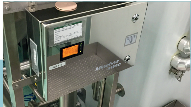
Minebea Intec's load cells and weighing electronics provide reliable weighing of process vessels