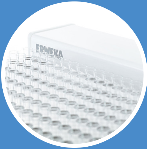
FRL sample collector for DT Offline System with Disso.NET