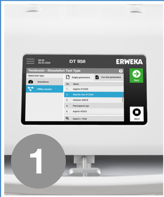
Step 1: Select your desired test type and click on a created method or empty parameters.