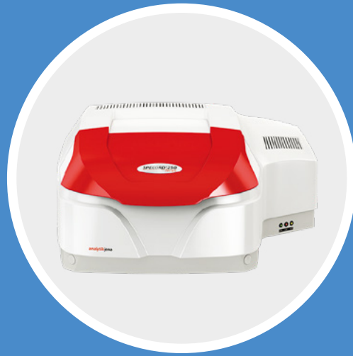
Analytik Jena spectrophotometer for DT Online UV/Vis System