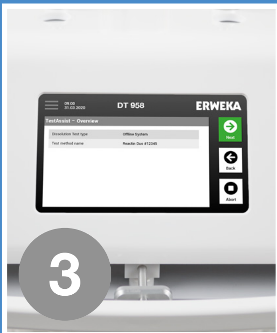
Step 3: Here you can see an overview of your chosen test and the method.