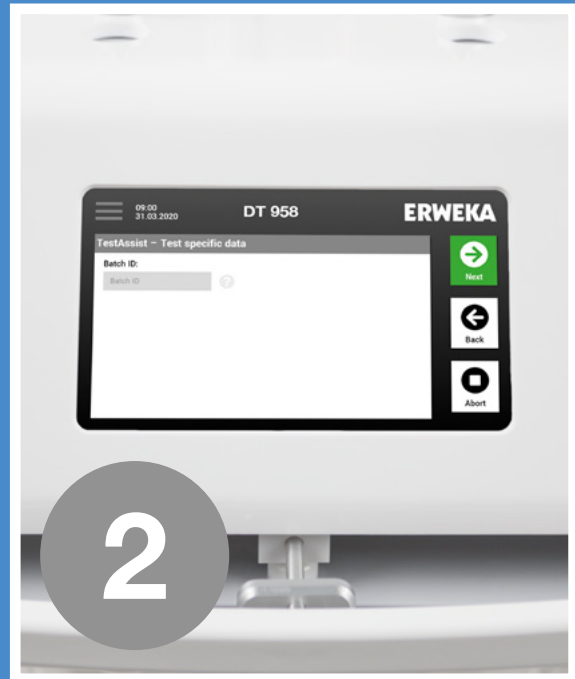
Step 2: Add a batch ID or in case you selected empty parameters add an apparatus, product name and general information.