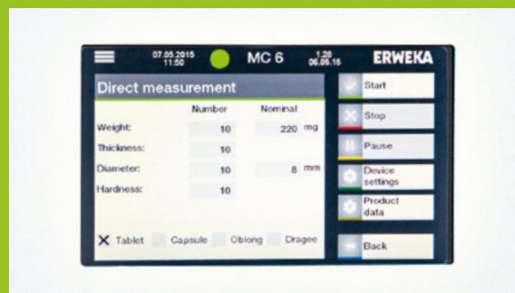
Direct measurement menu for quick-starting tests.