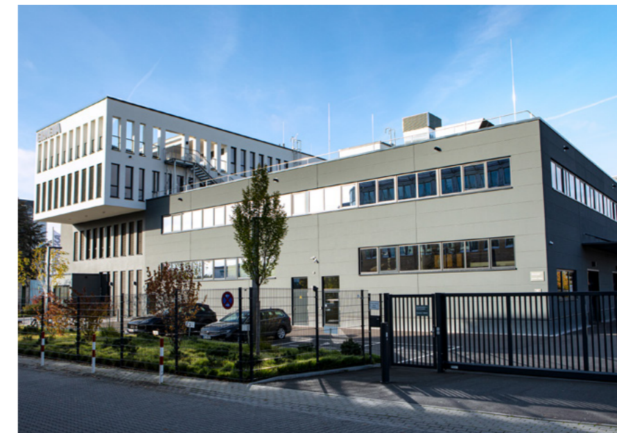
ERWEKA GmbH in Langen, Germany

ERWEKA customers around the world benefit from these decades of experience and the technologies we have developed.