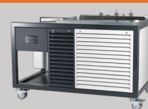
Base Cart Chiller 5000