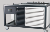
Base Cart Chiller 5000