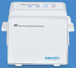
PVP or IPC pump