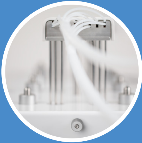
Automated sampling station ASS-9