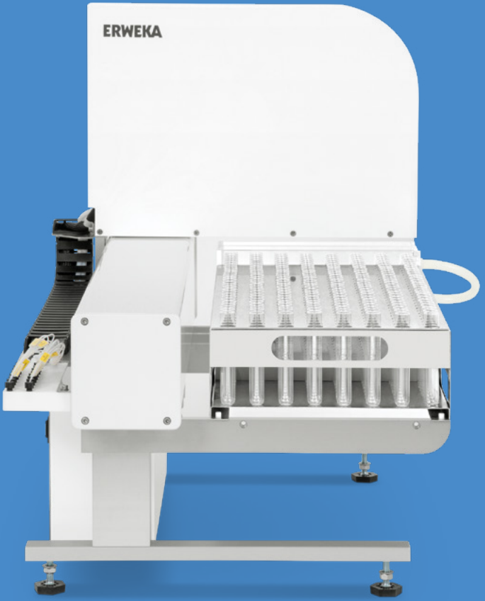
Sample collector FRL