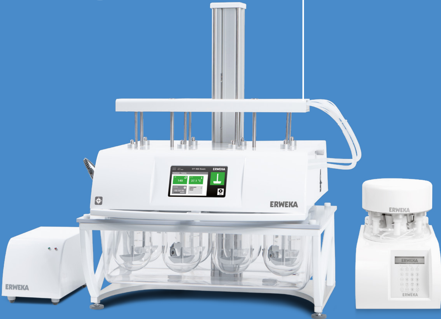
DT 950 Series with up to 8 test stations