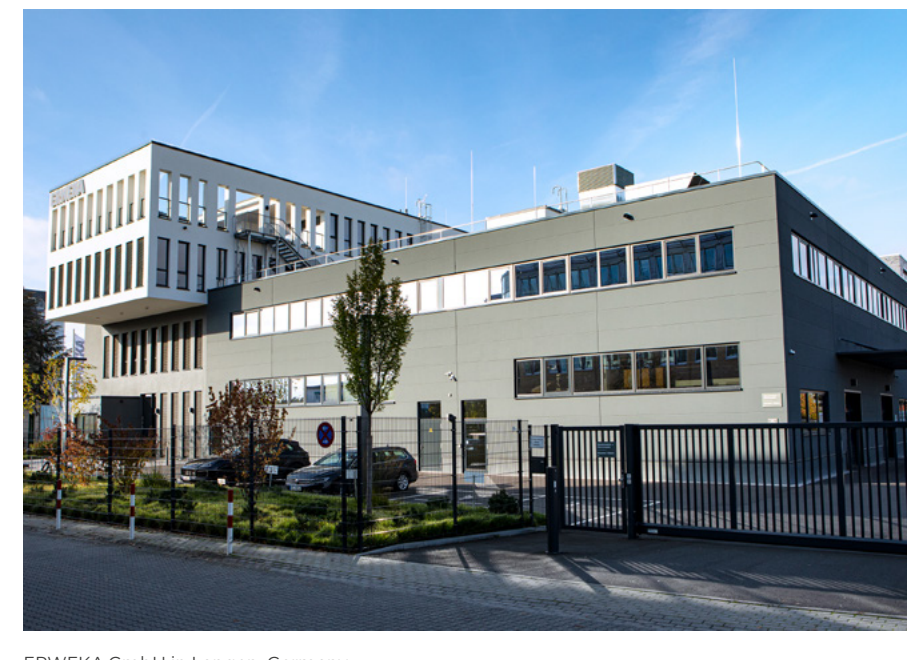
ERWEKA GmbH in Langen, Germany

ERWEKA customers around the world benefit from these decades of experience and the technologies we have developed.