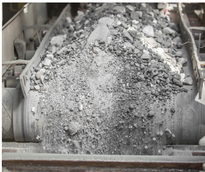
Metal parts in the raw materials can damage the grinding mills and impair production.