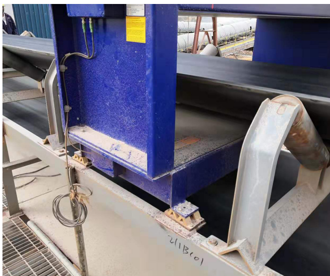
The divisible coil ensures easy integration into existing product lines.

shutdowns due to machine defects or false alarms. The direct and indirect costs from customers have significantly decreased, since the inspection.